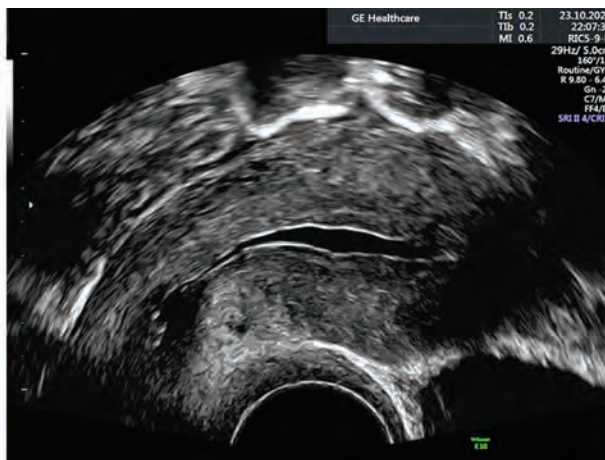
Standard 2-D TVU -- with ULTRAST GEL