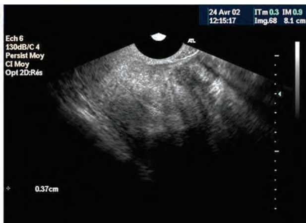
Standard 2-D TVU -- without ULTRAST GEL no pathology seen