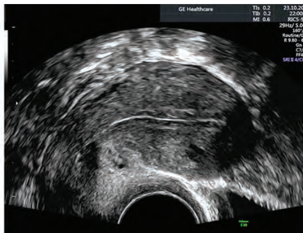
Standard 2-D TVU -- without ULTRAST GEL