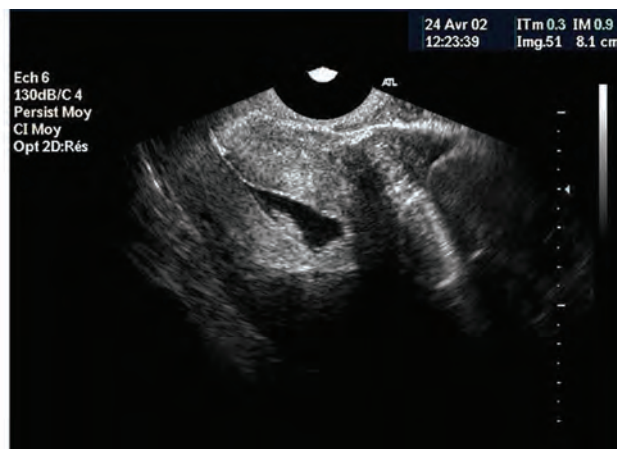
Standard 2-D TVU -- with ULTRAST GEL note polyp present