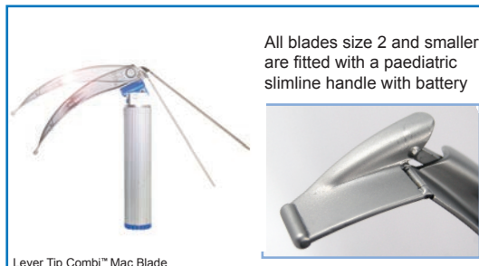
Lever Tip Combi™ Mac Blade

All blades size 2 and smaller are fitted with a paediatric slimline handle with battery